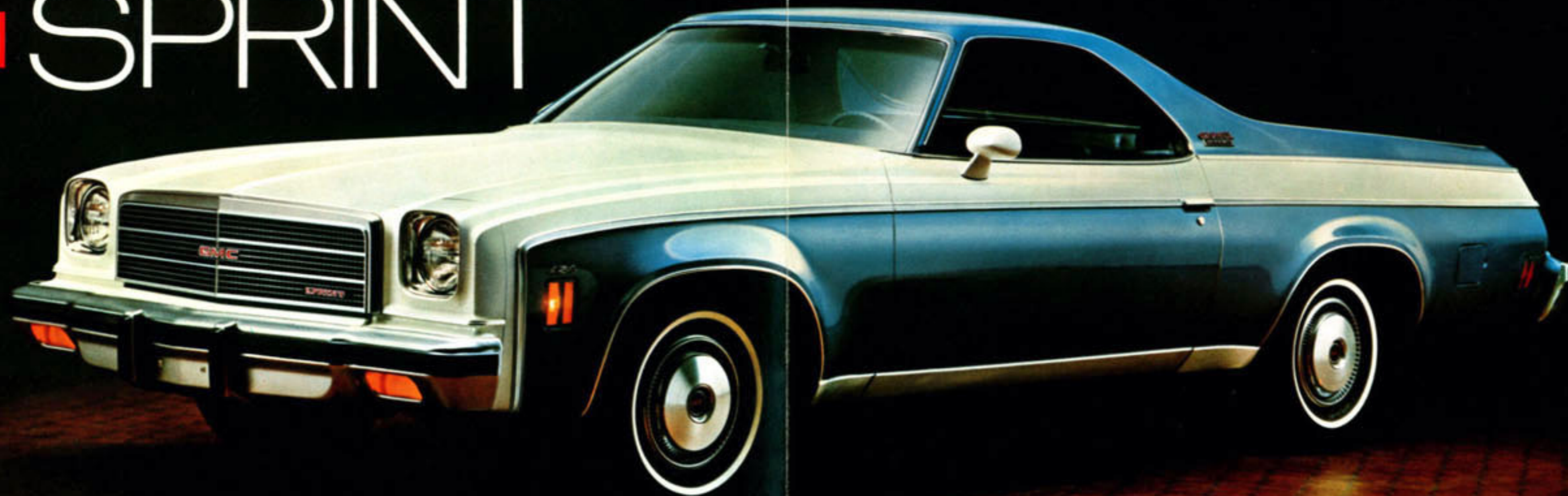
Shown above—Sprint Sierra Madre del Sur.