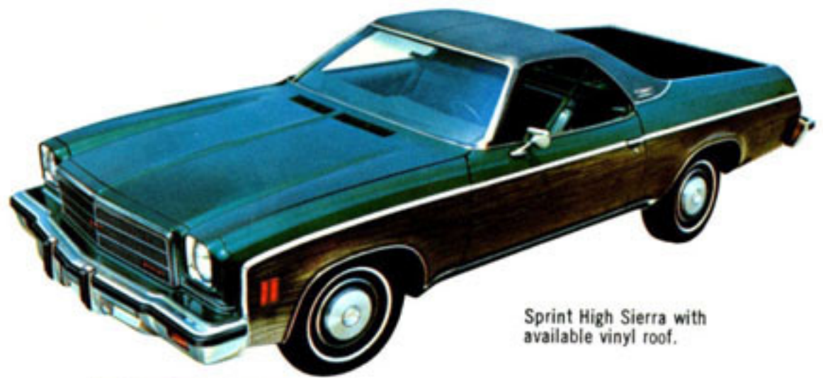
Sprint High Sierra with available vinyl roof.

TRUCK & COACH DIVISION GENERAL MOTORS CORPORATION Pontiac, Michigan 48053